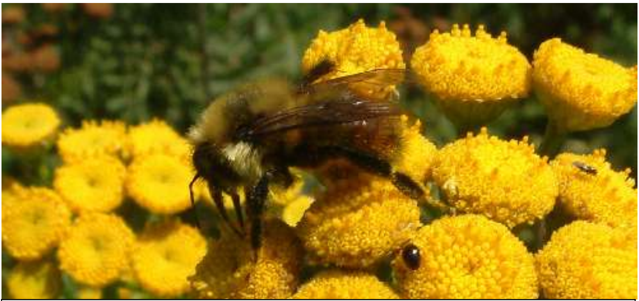
Figure 8. The workhorse of the garden, the first bumblebee (Apinae, <u>Bombini</u> sp.) in spring is a welcome sight to those starting crops of beans, tomatoes and other vegetables. They are generally bigger and hairier than most other bees and will forage through a wide range of flower types. While there are several species in central Canada, they are all easily recognized as bumblebees.

Besides the imported honeybee, the bumblebee is the dominant group of social bees in the northern latitudes.<sup>66</sup> Bumblebees have a fat furry look, and are large-bodied bees. They require sustenance throughout the spring, summer and fall.<sup>39</sup> A large bumblebee colony will have, at its peak in late summer, 150-200 bees.<sup>23,29</sup> A typical underground nest will be 15-23 cm in diameter with a 30 cm, sloping, 2.5 cm wide, tunnel.<sup>23</sup> Some bumblebees are attracted to deserted mouse nests. Poor drainage can affect bumblebee nests.<sup>23,39,44</sup> Males and queens are born at the end of the season. Bumblebee queens mate in late summer and store fat since they are the only colony members that over-winter.<sup>23,29</sup> The queen lays her eggs in the spring and forages to feed the larvae herself until the first workers mature.<sup>29</sup> Males, produced from unfertilized eggs, leave the nest to forage on their own.<sup>23</sup> Many bilaterally symmetrical flowers (zygomorphic) and flowers with deep corolla tubes (stereomorphic) rely on bumblebees for successful pollination.