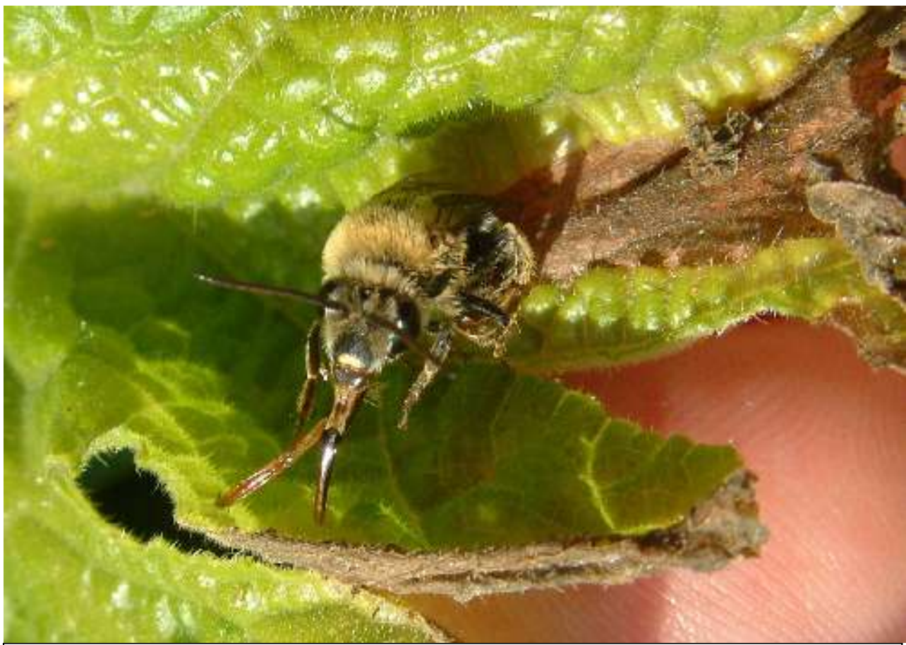
Figure 4. A close-up front view of this squash bee (<u>Peponapis pruinosa</u>) provides a good view of how bees have adapted their mouth parts for sipping nectar from nectaries below the flower's stamens and pistils. As a member of the Apidae, this bee illustrates the long-tongue bee.

visitors so that they carry pollen to other flowers of the same species. The correct insect anatomical and behavioural fit and floral advertisement and rewards are required. Many flowers are effectively pollinated by a diversity of animals. Very few plants are pollinated by a single species.<sup>37</sup> An insect must be a frequent floral visitor in order to be effective. Because a plant only requires its pollinators for short periods of the year, these insects must either forage at other plants or shorten their adult life and schedule it to that particular flowering period.<sup>57</sup>