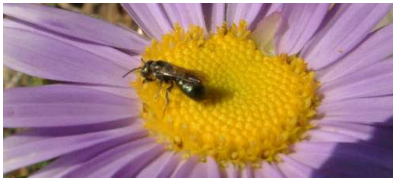
Figure 16. A close look at this very shiny and dark blue bee with the rather square appearing back-end and a small ivory marking on the face will distinguish this small carpenter bee from the small sweat bees. In reality though, when seen on the wing, it is very difficult to tell this small bee from the small blackish bees that have evolved in four other bee families.

Typically, biological scientists have interacted with volunteer observers by suggesting that they bring in a sample specimen of the animal in question for proper lab examination and identification. There have been citizen science programs created based on volunteers collecting and mailing in samples to scientists. Although killing and collecting is a far more reliable means of identification than recorded observations, the identification of specimens being regularly mailed in by potentially a thousand volunteer observers would overwhelm the limited number of professional entomologists available. For most gardeners, the thought of killing a bumblebee as a reward for having just pollinated their flowers should be less appealing than just observing how it lives and functions. Therefore, the approach proposed here will be to ask volunteer observers to record the diversity of insect types they see without taking samples and without necessarily achieving specific identification of any one species.<sup>18</sup>