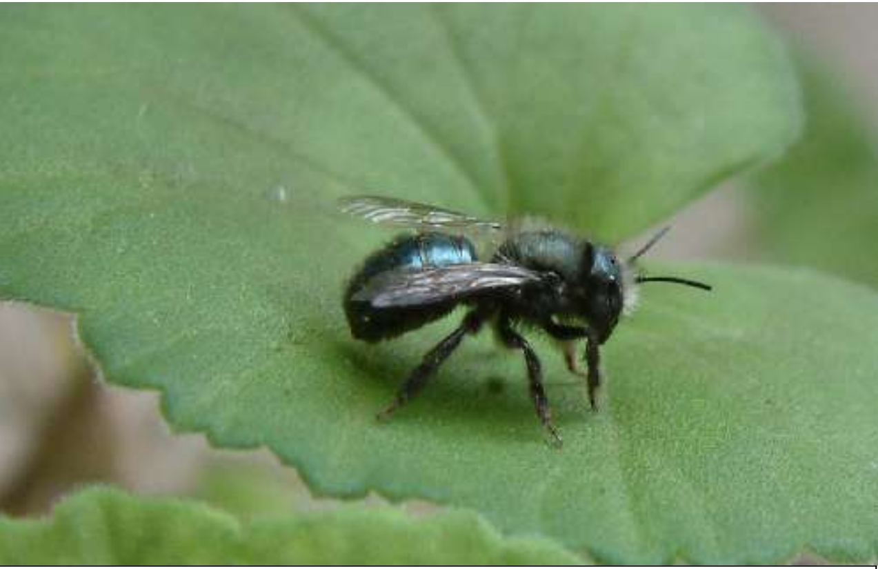
Figure 14. Until recently, the blue orchard bee (Megachidae, <u>Megachile osmia</u>) has been an unsung hero in terms of the contribution it makes as a pollinator in tree fruit and berries. There is, however, growing interest in raising and exploiting these bees for managed pollination services. They are most likely to be seen in the tops of flowering trees in the spring.