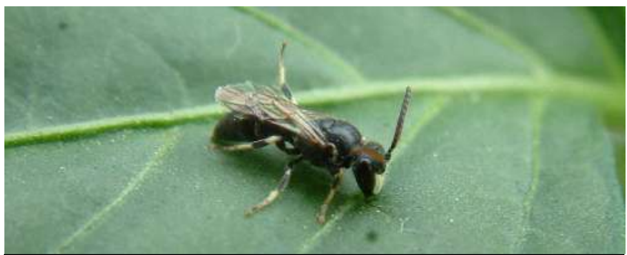
Figure 6. A member of the most primitive family of bees, this Colletidae (<u>Hylaeus</u> sp.) has no pollen baskets and looks the most like a wasp of any bee family, with white or yellow markings, most apparent on the male. Bees in this genus are quite small and the females can be mistaken for sweat bees or small carpenter bees when observed on the wing.

group of older families distinct from the long-tongue bees,<sup>49</sup> most experts put colletid bees at the base of the evolutionary tree for bees. Long-tongue bees would occupy one branch in the tree.<sup>50</sup> Interestingly, andrenid bees seem to have evolved their short-tongues independently from the other short-tongue families.