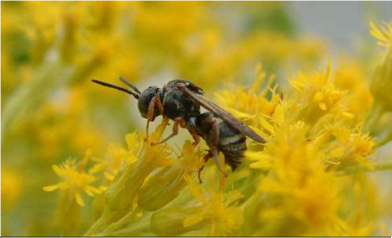
Figure 9. The nomada bees (Nomadinae), such as this one, are all cuckoo bees (cleptoparasites), though not all cuckoo bees belong to the Nomadinae. While cuckoo bees are frequently seen foraging for nectar, they are not considered to be good pollinators. They are wasp-like with very little hair, and often have bright, sharply contrasting colours.

Different species of cleptoparasitic bees use different strategies to obtain entry into the nests of their hosts.<sup>23,56</sup> Some wait until the nesting female is out foraging and enter the nest, open a brood cell, remove the egg that is there and replace it with one of their own. Others simply lay their egg in an already occupied host brood cell and the cleptoparasitic larva develops very quickly and kills the host's egg or newly hatched grub.