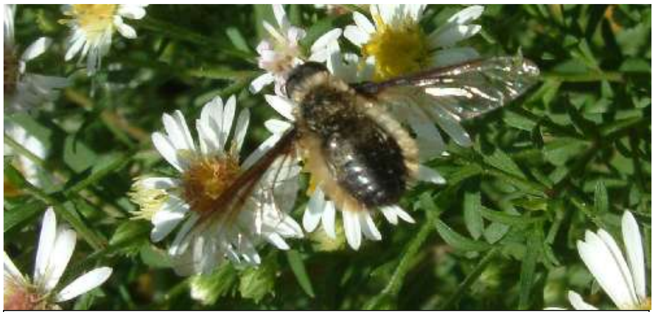
Figure 17. As adults, bee flies (Bombyliidae) are frequent floral visitors and are moderately good pollinators. Their larvae are parasites of bees and wasps. They are hairy and typically quite large for flies, and their wings are wide-spread at rest. In this case the lack of hindwings is quite evident and is a feature that distinguishes them from bees and wasps.

Flies are distinct from bees and wasps because they only have one pair of membranous flying wings. The hooked fore-and-aft wings of bees and wasps make them appear much like a single pair. Thus, this feature is usually not a good diagnostic without destructive sampling (Instead, the thicker waist, very skinny legs, larger eyes that dominate the face, and the short feathered, rather than long and slender, antennae are better than wings for distinguishing flies from bees.). Beetles can be distinguished from sucking bugs, such as stink bugs, by wings that meet in a straight margin down the centre of their backs, rather cross over their backs. Butterfly wings usually fold up at rest and moth wings usually lie flat or fold down and back.