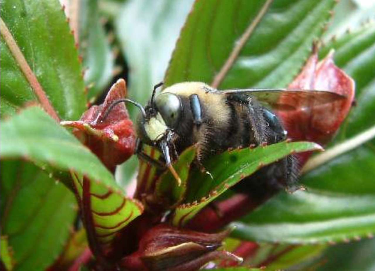
Figure 10. The carpenter bee (Xylocopinae, Xylocopa virginiensis) looks very much like

In spite of honeybee services, many crops have difficulty growing in new areas where their natural pollinators are absent.<sup>23</sup> For example, native bees in British Columbia are not abundant enough near blueberry, cranberry and raspberry patches to supply adequate pollination on those crops.<sup>46</sup> Although these fruit crops are not native to BC, the bio-geography and rainfall there do not explain low pollinator populations. Spraying with malathion and diazinon is common in the Fraser River Valley of BC, and it is probable that small, solitary bees have a greater susceptibility to pesticides. Spraying for spruce budworm infestations has had a similar impact on blueberries in Atlantic Canada.<sup>41</sup> In BC, nest habitat destruction, growth of residential areas in the valley near the berry patches and, possibly, competition from honeybees also account for the lack of native bees (Honeybees will often compete with wild bees for floral rewards.<sup>23</sup>). Annual fluctuations of native bees make them unreliable pollinators as well.<sup>23,46</sup> Specific wild bee pollinators can be exploited if peak crop flowering is timed with the bee life span. Keeping fields small, not planting competing crops near to each other, providing rough terrain for nest sites and allowing other early flowering plants to grow, will attract an assemblage of wild bees.