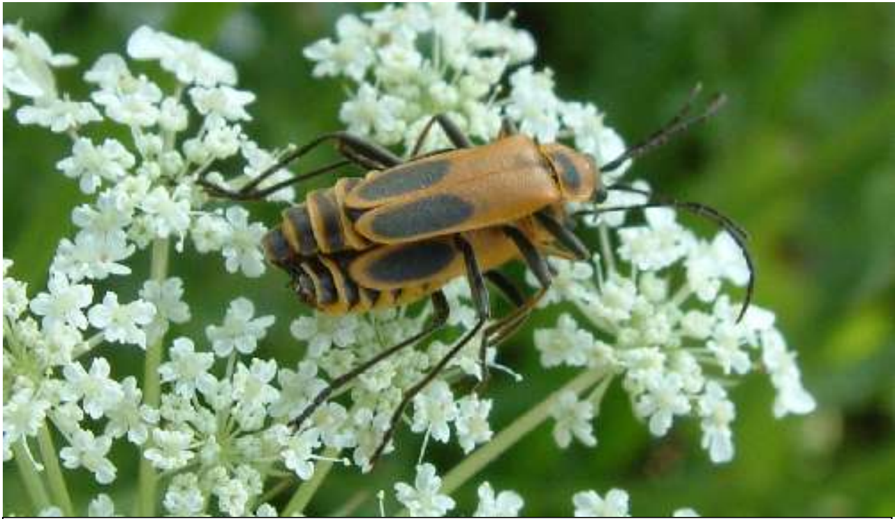
Figure 13. The goldenrod soldier beetle is the most commonly seen beetle on flowers in mid-to-late summer in southern Ontario and is seen in large numbers actively breeding and mating. They are frequently seen on both goldenrod and queen ann's lace. Not having hair, they are not considered to be very good pollinators.

Butterflies tend to fly at a constant height (typically 4 feet or less),<sup>63</sup> but like sunny, sheltered gardens.<sup>55</sup> Male butterflies can sometimes be seen drinking from mud or manure in order to get minerals to make pheromones.<sup>22,26</sup> Most butterflies will find their specific host plant on which to lay their eggs.<sup>22</sup> In evolutionary terms, the Lepidoptera made quite a recent appearance. In spite of this, butterflies and moths are diverse. But moths outnumber butterflies about nine to one and are about 100 million years older (140 and 40 million years, respectively).