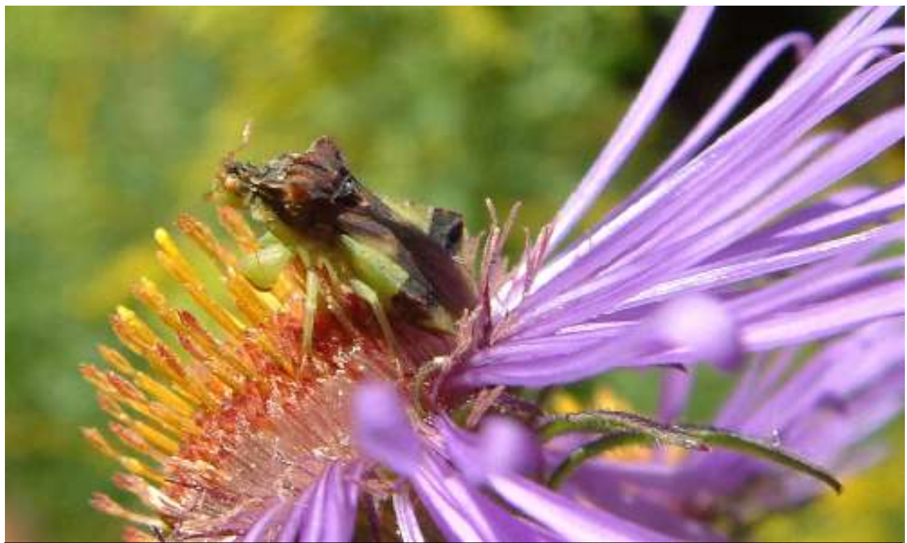
Figure 3. Ambush bugs (Phymatidae) are neither beetles nor pollinators, but sucking bugs (Hemiptera) that may look hideous, but are well-suited to their stationary predatory lifestyle on wild flowers such as goldenrods and asters. Their big shoulders and arms (forelegs) help them to achieve an astounding 95% success rate in attacks on floral-foraging insects.

(Lepidoptera), and some beetle families (Coleoptera).<sup>11,38,72</sup> All four orders undergo complete metamorphosis.<sup>6,63</sup> A few insects that are not from these orders have a minor role in pollinating plants.<sup>38</sup> For example, thrips (Thysanoptera) often are more damaging than they are beneficial during pollination.<sup>20,38</sup> Other insects that are commonly found sitting on flowers include the true bugs (Hemiptera). Rather than pollinating flowers themselves, ambush and assassin bugs are usually waiting for pollinators so that they can eat them. Other floral-based predators include crab spiders and candy striped spiders.