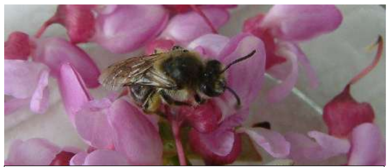
Figure 15. The andrenid bee (Andrenidae) is another of the typical bees that can be seen in spring in Ontario foraging in the tops of flowering fruit trees. Preserving these trees provides greater variety of habitat and forage, and promotes bee diversity. Although they are grouped with the other short tongue bee families, their hairiness and habits make them effective pollinators.

A diverse floral habitat provides the most abundant forage.<sup>47</sup> Flower-rich field borders, where noncrop forage plants are not treated as weeds, encourage beneficial insects to visit them.<sup>37</sup> Plants with small flowers rich in nectar attract beneficial predators to the garden, in addition to the regularly expected pollinating insects.<sup>25</sup> Field borders, fence lines and hedge rows provide habitat and eliminate the need for alternative food sources.<sup>29,38</sup> Agroforestry, including windbreaks, riparian forests and nectar-producing trees, holds promise for pollinator preservation.<sup>29</sup> While modern agriculture has moved towards more sustainable practices, there is still no habitat management program for wild pollinators. The same holds true for urban environments. Although fragmentation can be a factor within city limits, some surprisingly vibrant pollinator communities can be observed.