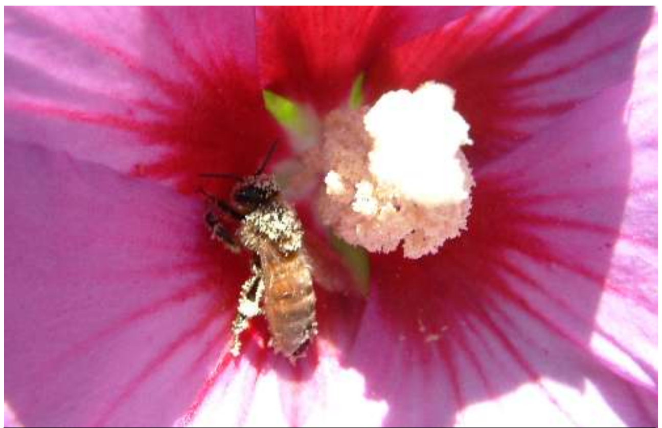
Figure 1. Although most bees, particularly honeybees (<u>Apis mellifera</u>), rake most of the pollen they gather into their pollen baskets, the only viable pollen is that which sticks to their back where it can't be reached. The honeybee is what most people think of when bees are mentioned, even though it is not native to North America.

Obligatory flower feeders, such as adult bees and butterflies, derive all of their nutrients from flowers.<sup>9</sup> Nectar is the ideal food for such insects, providing easily digested, high energy sugars, namely sucrose, fructose and glucose. A dilemma that plants must deal with is that their floral products can be attractive to visitors that are ineffective pollinators.<sup>57</sup> Complex, even exotic, flower appearance is usually an effort to restrict their rewards to effective pollinators. Decoy nectaries, often external to the flower, also serve this purpose.<sup>10,38</sup> Because many flowers require loyalty from their insect partners, insects with memory (such as bees and some flies), or those that have evolved innate preferences, often make better partners.<sup>9</sup>