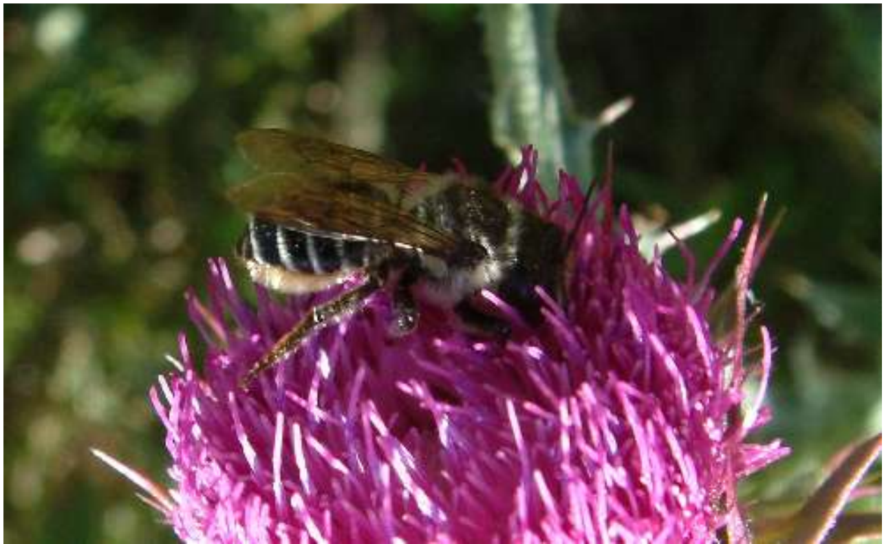
Figure 2. One family of bees, Megachilidae, stands out as using abdominal, rather than leg, hair as their pollen baskets. The highly valuable alfalfa leafcutter bee is in this family. The example in this illustration is in the <u>Megachile</u> genus.

Pollinating insects have evolved specialized mouth parts.<sup>56</sup> Butterflies and moths have a long narrow tubular proboscis through which nectar, and other liquids, can be sucked (see Figure 12). Most beetles have mouth parts primarily adapted for chewing with laterally moving mandibles. The chewing mouth parts provide another way of identifying beetles versus true bugs which have sucking, tubular mouth parts. Bees, wasps and flies have a more complex set of mouth parts that involve lapping and sucking structures but the flies no longer possess distinct mandibles, and so cannot bite or chew. Some bees use their mandibles to loosen pollen on anthers, most bees and wasps use their mandibles to help them construct their nests. As well, bees have evolved a tongue which allows them to sip nectar, and tongue-length is also a useful basis for grouping bee families (see Figure 4).