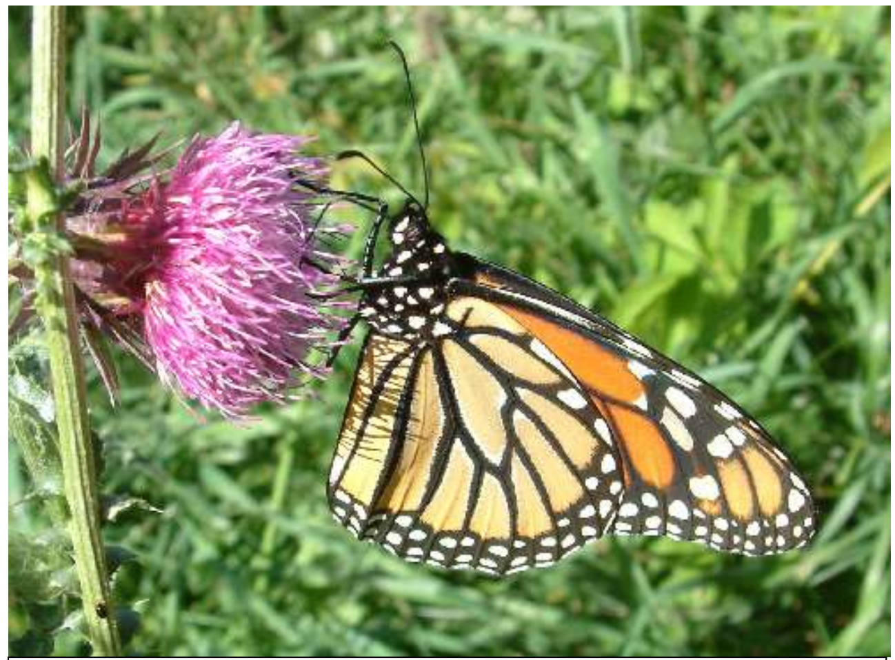
Figure 12. The appearance of butterflies is always popular with gardeners, but the most revered of the butterflies in North America is the monarch butterfly (<u>Danuus plexippus</u>). As both a long-distance migratory flier and a pollinator, they demonstrate the interconnectedness between floral ecology and other ecosystems. Unfortunately, butterflies are more decorative than effective as pollinators, particularly in comparison to bees.

Flowers pollinated by diurnal butterflies and moths are colourful, usually blue or violet, while those pollinated by nocturnal moths are pale or white, and strongly scented.<sup>20,55</sup> Most moths are nocturnal while most butterflies are diurnal. Butterflies thrive in open meadows with a diversity of plants. Skippers thrive in the temperate grasslands in both North America and Asia and their larvae are grass feeders.<sup>22</sup>