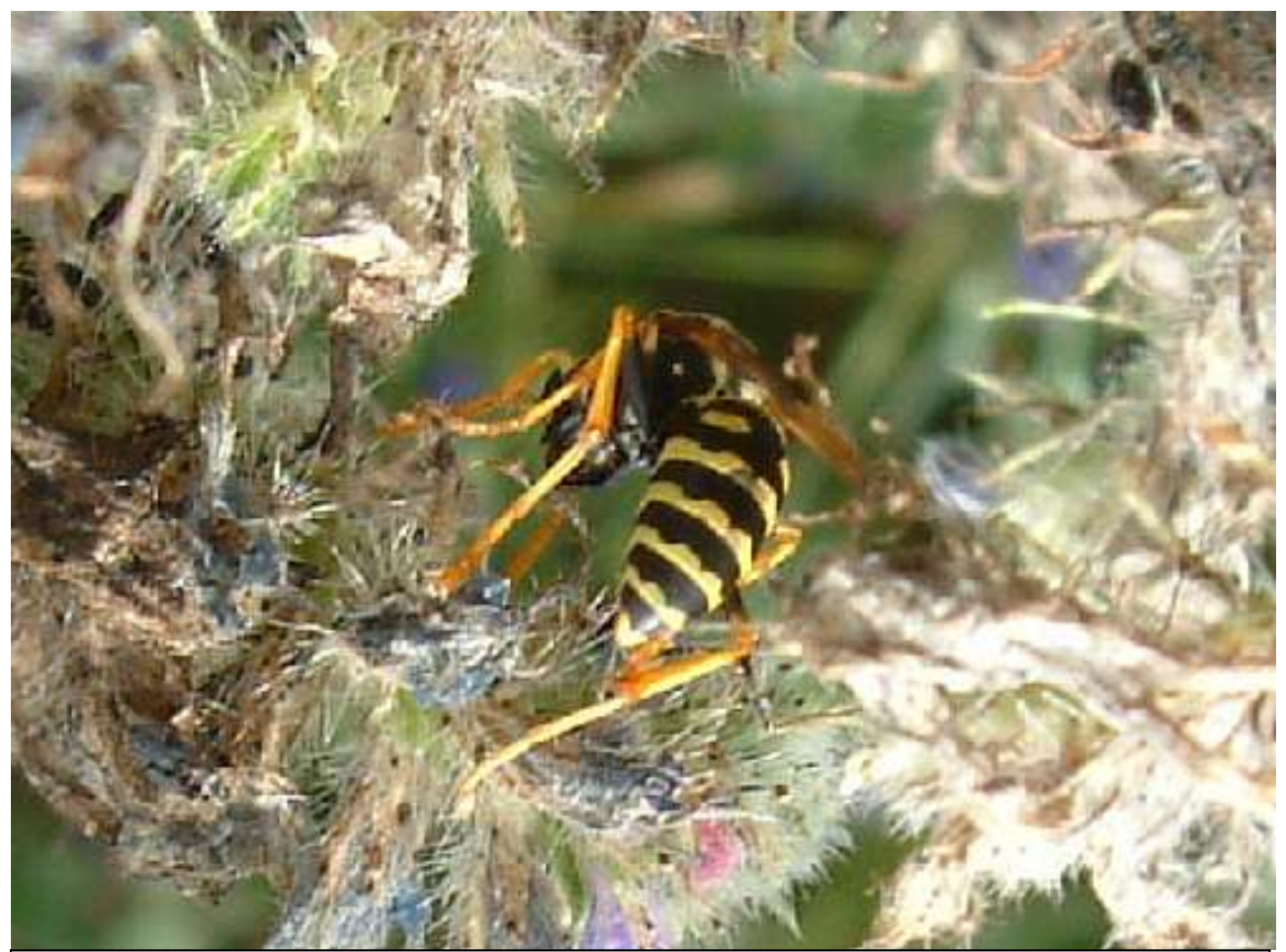
Figure 5. This Yellow Jacket Hornet (Vespidae, <u>Polistes dominulus</u>) is looking through these senescent flowers for small insects that it will chew up to take back to its hive as food for the larvae, but it will also take nectar, particularly in late summer. They role their wings when not in flight, rather than fold them back over their bodies the way bees do. Their social structure is much like the honeybee, with the bulk of the population made up of sterile females.

Another group of wasps that is important in the garden is the group from which the bees arose.<sup>56</sup> The apoid wasps (referred to in the past as Spheciformes or sphecid wasps), are solitary and mostly nest in the ground, although some nest in plant stems or holes in wood. The habit of digging nests in the ground gives them their common name of digger or sand wasps. They construct a simple nest and collect animal matter, usually other insects, for their offspring to eat. The prey is paralysed, rather than chewed up, in this way staying fresh until it is eaten by the wasp larva.