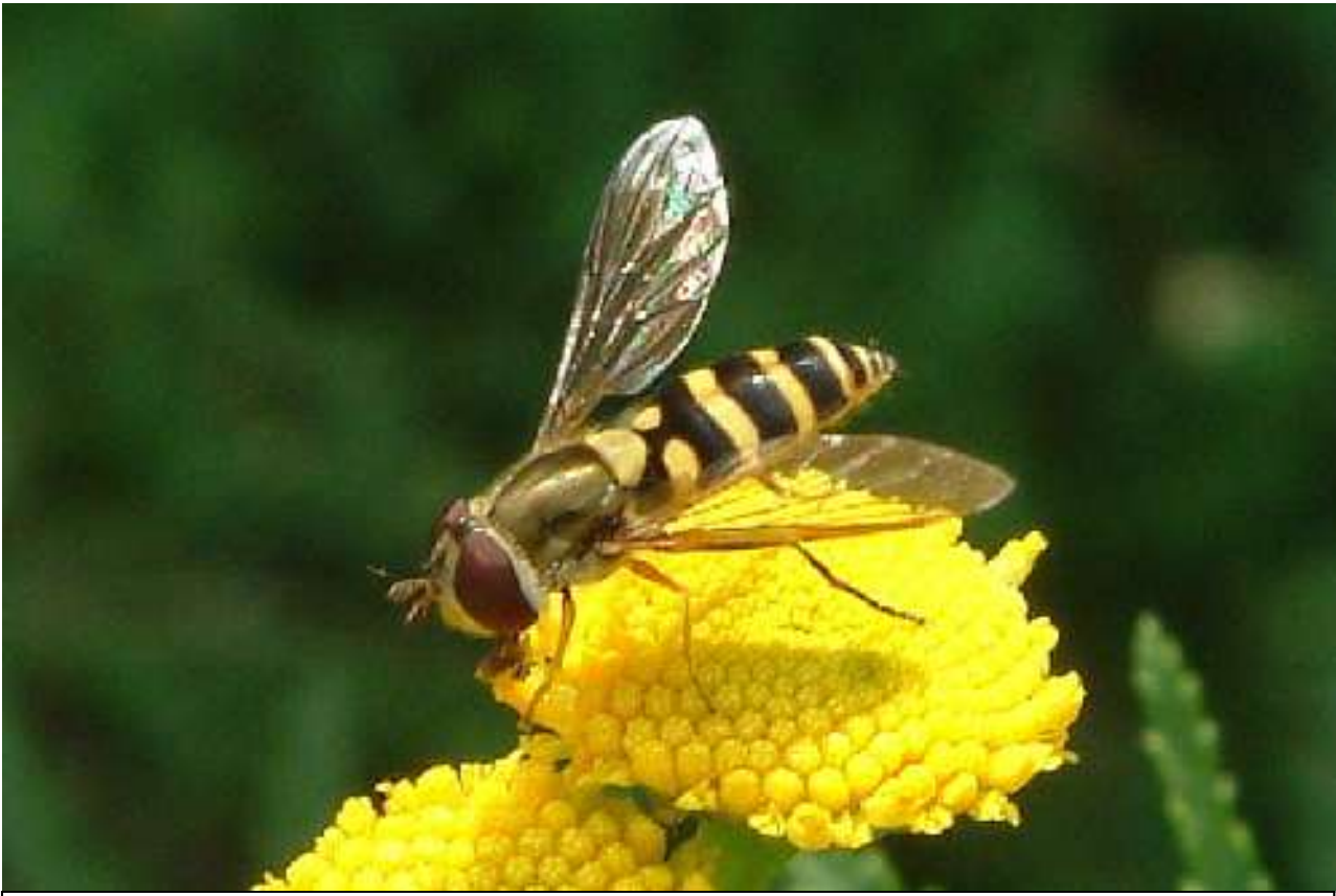
Figure 11. Hover Flies (Syrphidae) are very commonly seen hovering and darting among wild flowers throughout the summer, but seldom caught at rest like this one. A fair variety of syrphid flies can be seen in North America, but they almost all share the black and yellow or black and orange colouring that mimics bees and wasps.

Blue bottle and green bottle flies (Family Calliphoridae) are frequently seen around plants and occasionally on some flowers. They are also typically seen, however, around garbage or decaying carcasses where they lay eggs. They are best known for their parasitic larvae and as carrion feeders and disease vectors.<sup>64</sup> They are not significant pollinators and are not beneficial otherwise.<sup>43</sup> The feeding habits of flesh flies (Family Sarcophagidae) are much like blow flies and they also are not important as pollinators. Empid (or Dance) flies (Family Empididae) are known for their swarming and courtship dance.<sup>43,48</sup> Although less effective pollinators than bee flies or syrphids, they are common floral visitors and nectar feeders. They are also wide-spread and predatory.