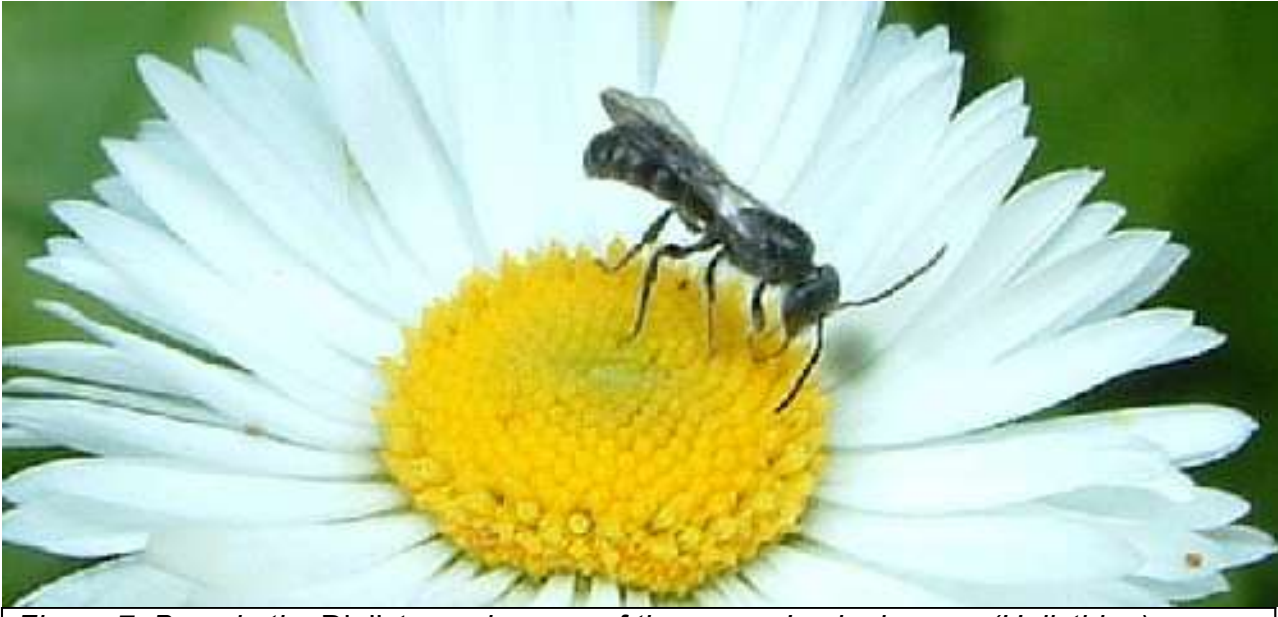
Figure 7. Bees in the Dialictus subgenus of the genus <u>Lasioglossum</u> (Halictidae) are small and can be green, brown or blackish, with even some orange in a few species. Most species nest in the ground, but a few nest in rotten wood. Some species in Canada are social with up to several dozen individuals in a nest.

all of the sperm that they contribute to produce daughters are identical.<sup>57</sup> Hence, daughters of a fertilized queen are more closely related than sisters would be from a diploid father, and more closely to each other than to the queen. Since one of the sisters will eventually become a queen, it is a genetic advantage for the others to sacrifice their own eggs (becoming worker bees) toward the much higher probability of survival for eggs from their breeding sister than for their own eggs. The evolution of the cooperative sisterhood society was also advantageous among Hymenoptera because, with complete metamorphosis, larvae must be fed and protected by adults.<sup>11,54,66</sup>